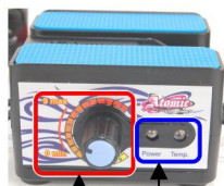
Temperature Indicator Control Indicator Lights